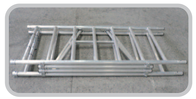
Folding Base Unit