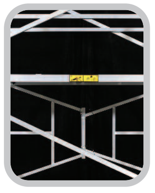
Folding Base Unit