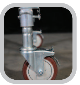
Adjustable Leg and Castor