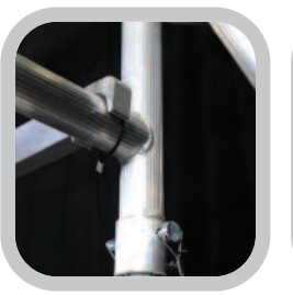
Brace Hook Frame Locking Pin