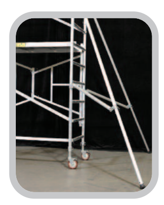
Outrigger Extension Pack